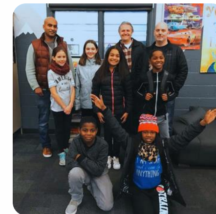
Rotary Boys & Girls Club